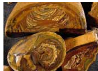
This is a Pinterest image from Oasis Prospecting Co.

One image on another website featured a beautiful specimen with shiny metallic dendrites! That is quite remarkable for sure.