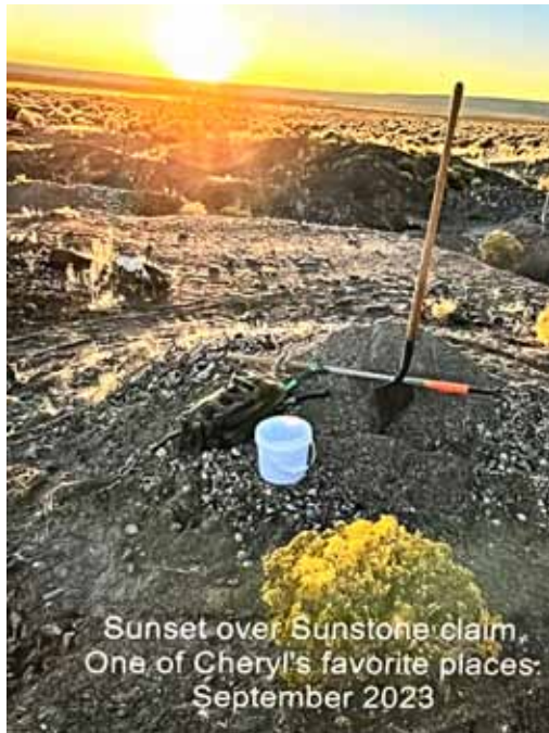
Sunset over Sunstone claim, One of Cheryl's favorite places: September 2023

Gigi Stevens took a beautiful and poignant photo of the sun setting over Cheryl's tools at her digging site during her last trip.