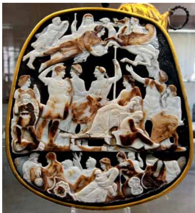
The Great Cameo of France. Five-layered sardonyx cameo, Roman artwork, second quarter of the 1st century AD.

Sardonyx comes from regions across the globe, including Brazil, India, Germany, Uruguay, Czech Republic, Slovakia, Madagascar and in the Lake Superior region of the United States. The finest examples, which display sharp contrasts between layers, are found in India, where the geological composition is perfect for vibrant, flawless, and colorful stones.