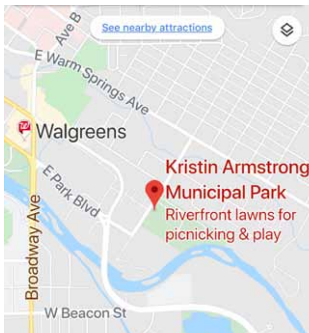
Map to Picnic Location Kristen Armstrong Municipal Park 500 S. Walnut St., Boise Tuesday, July 18, 2023 6:00 p.m.

After dinner there will be an Auction to help offset costs for our annual Banquet in January. Bring whatever you would like to donate and be ready to look for new pieces for your collection! Come join us for a fun evening! Hope to see you all there!