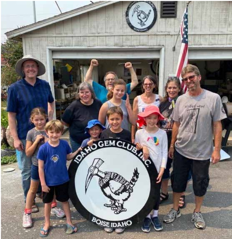
Kids' Day, August 2021