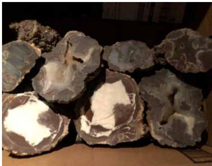
Succor Creek Thundereggs

THANKS FOR YOUR UNDERSTANDING AS WE NAVIGATE THE NEXT FEW MONTHS