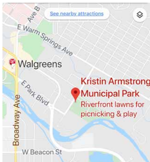
Map to Picnic Location Kristen Armstrong Municipal Park 500 S. Walnut St., Boise Tuesday, August 18, 2020 6:30 p.m.