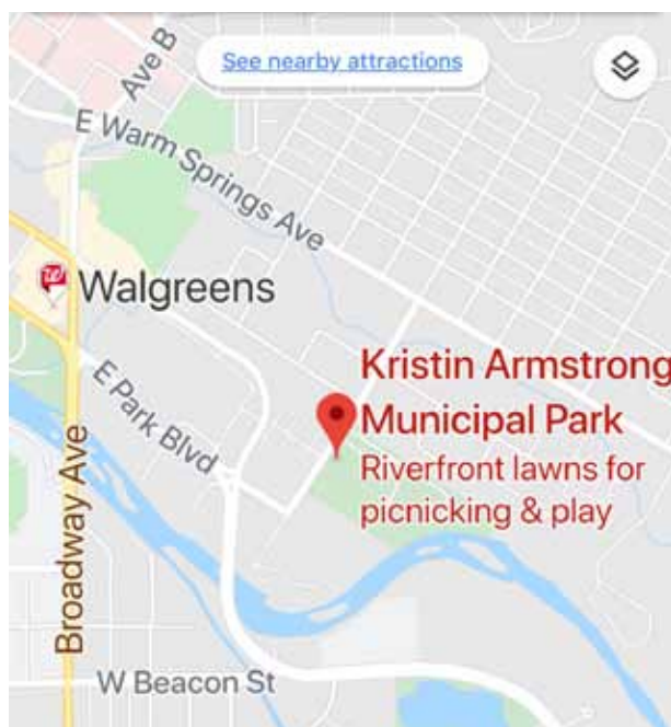
Map to Picnic Location Kristen Armstrong Municipal Park 500 S. Walnut St., Boise Tuesday, August 18, 2020 6:30 p.m.