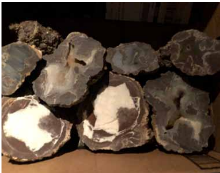
Succor Creek Thundereggs

THANKS FOR YOUR UNDERSTANDING AS WE NAVIGATE THE NEXT FEW MONTHS