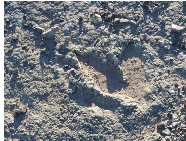
DINOSAUR TRACKS IN MILL CANYON