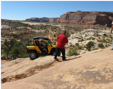
TRAIL LEADER ATTACHES ROPE TO ATV TO ENSURE TIRES REMAIN ON THE GROUND!