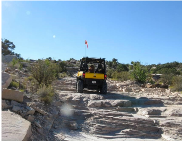
GOOD SAMPLE OF 7 MILE TRAIL

http://www.discovermoab.com/moab_dinosaurs.htm