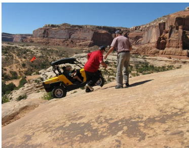
ANYONE WHO ROLLS THEIR MA- CHINE HERE IS FIN- ISHED. THERE IS LITTLE HOPE OF SURVIVAL!