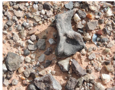
DINOSAUR BONES AT BIG SNAKE AREA IN MILL CANYON. NO- TICE ABUN- DANCE OF AGATES!