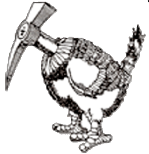
The Whangdoodle Bird (Often seen on field trips)