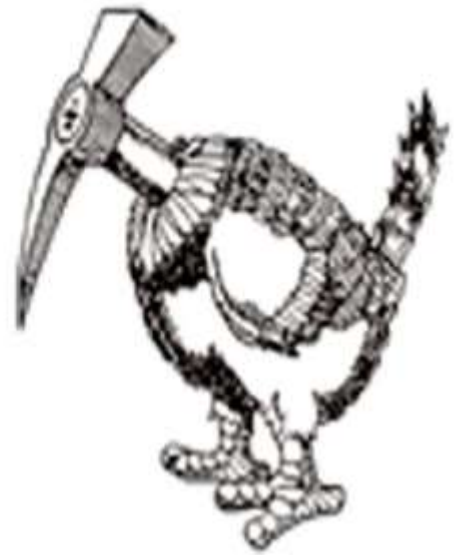
The Whangdoodle Bird (Often seen on field trips)